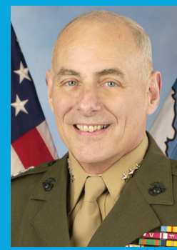
JOHN F. KELLY GENERAL U.S. MARINE CORPS (RET)

General John F. Kelly, who served as White House Chief of Staff under President Donald Trump from 2017-2019, will speak to Kentucky business leaders in July about leadership, the current state of affairs, as well as a behind-the-scenes look at presidential decision making.