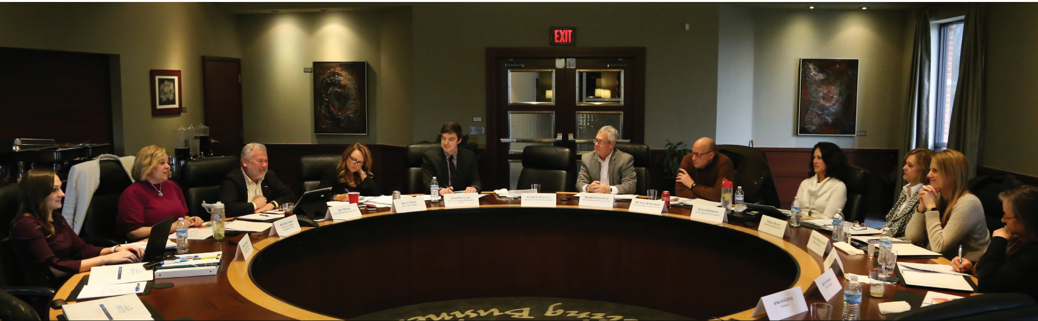
The Workforce Center Board of Directors meets quarterly to address workforce needs of the Kentucky business community.