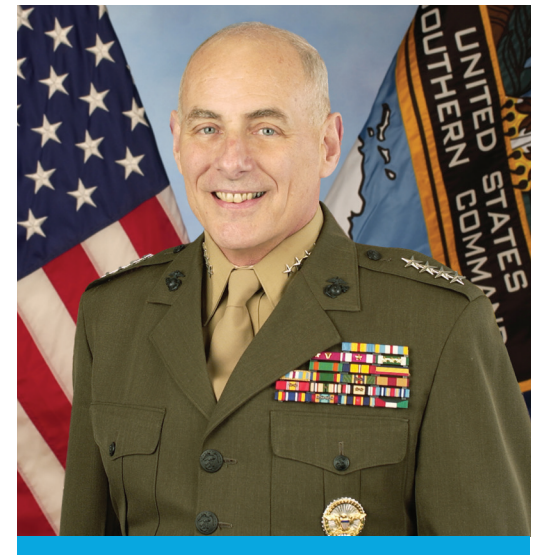
JOHN F. KELLY GENERAL U.S. MARINE CORPS (RET)

presented by BINGHAM GREENEBAUM DOLL LLP