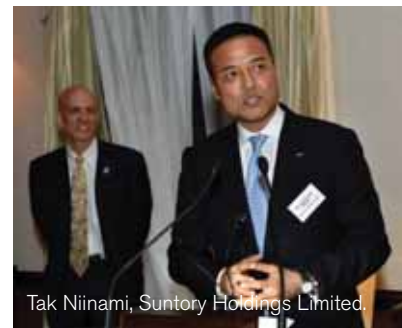
Tak Niinami, Suntory Holdings Limited.