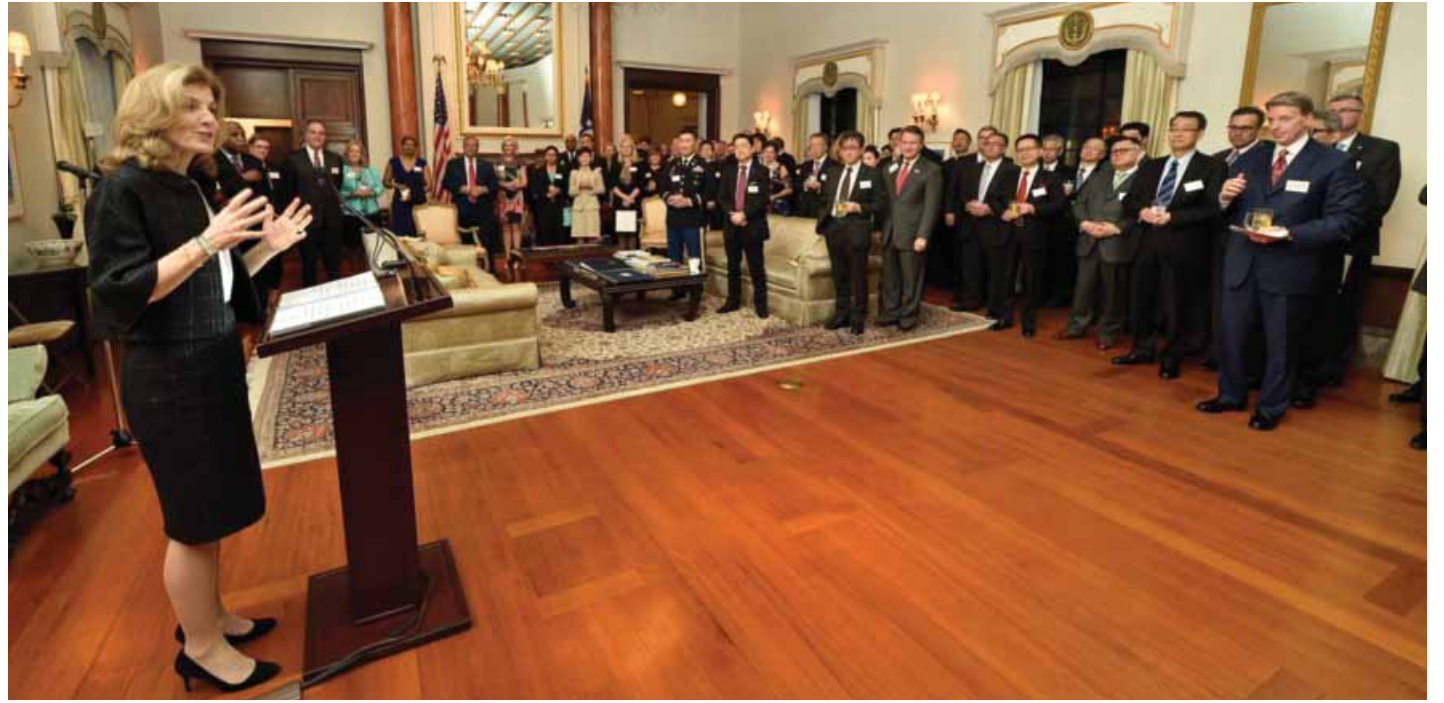
U.S. Ambassador to Japan Caroline Kennedy welcomed Japanese business representatives and Kentucky Chamber delegates to a reception on April 21 in Tokyo.