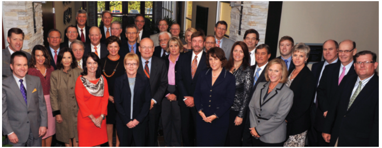
The Kentucky Chamber's 2012-13 Board of Directors, pictured above, met at Chamber headquarters in October. The board approved a new three-year strategic plan and the 2013 Legislative Agenda.

The plan will focus the efforts of the board and staff for the next several years, and an annual business plan will allow for continual monitoring of the progress toward these goals.