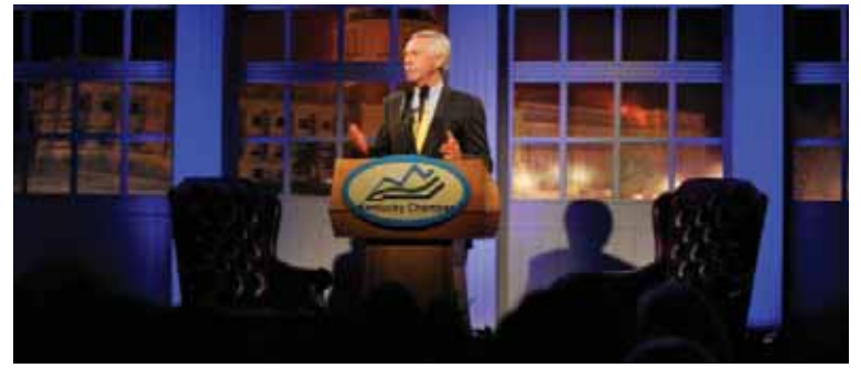
Gov. Steve Beshear, shown here at Kentucky Chamber Day in Jan. 2012, will be one of the featured speakers at the 18th Annual Kentucky Chamber Day on Jan. 10, 2013.