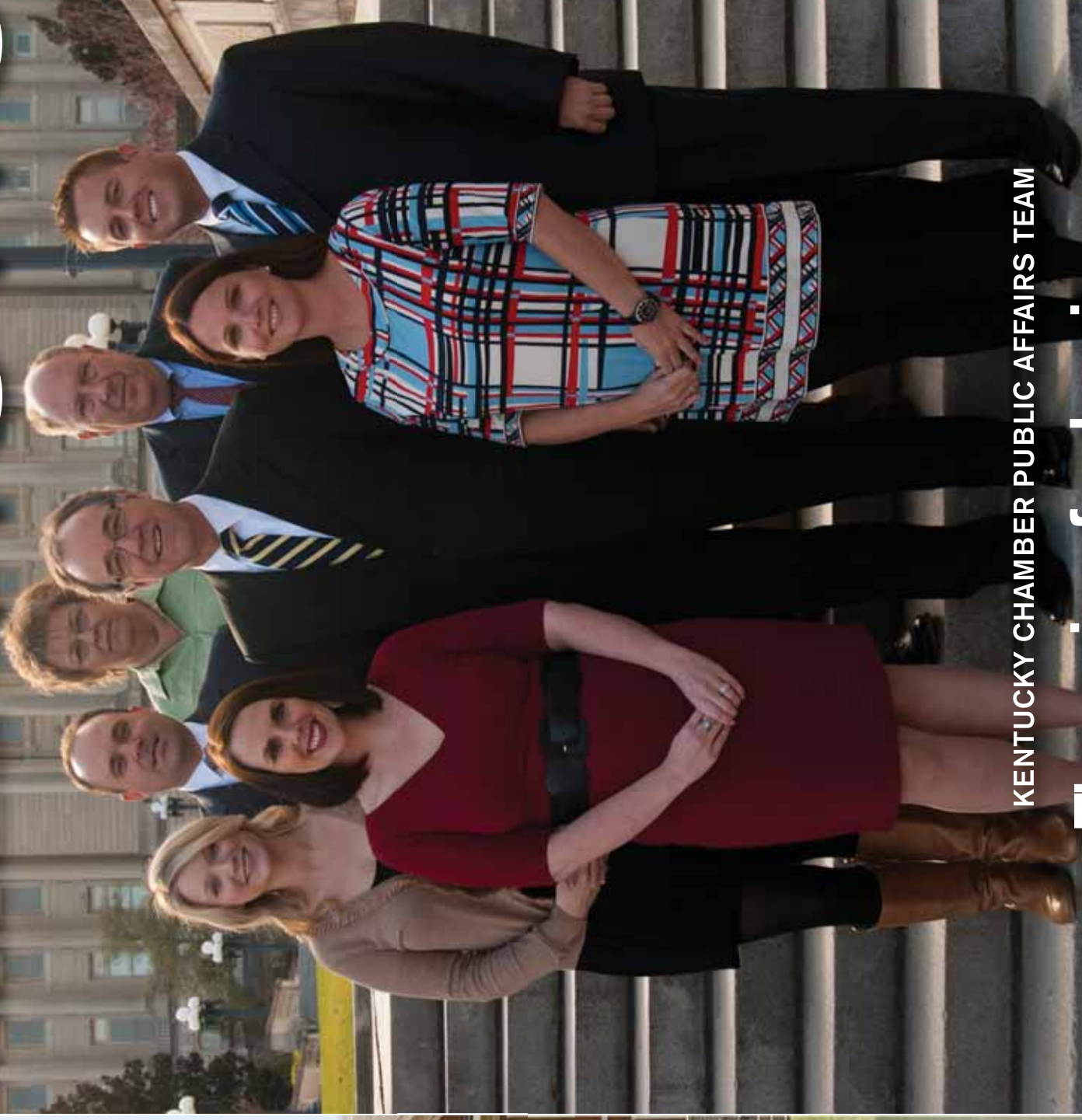
KENTUCKY CHAMBER PUBLIC AFFAIRS TEAM

The voice for business at Kentucky's Capitol