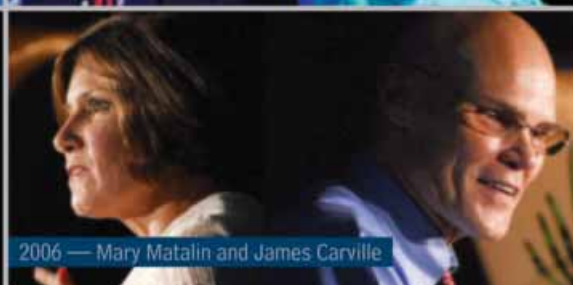
2006 — Mary Matalin and James Carville