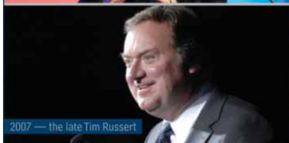
2007 — the late Tim Russert