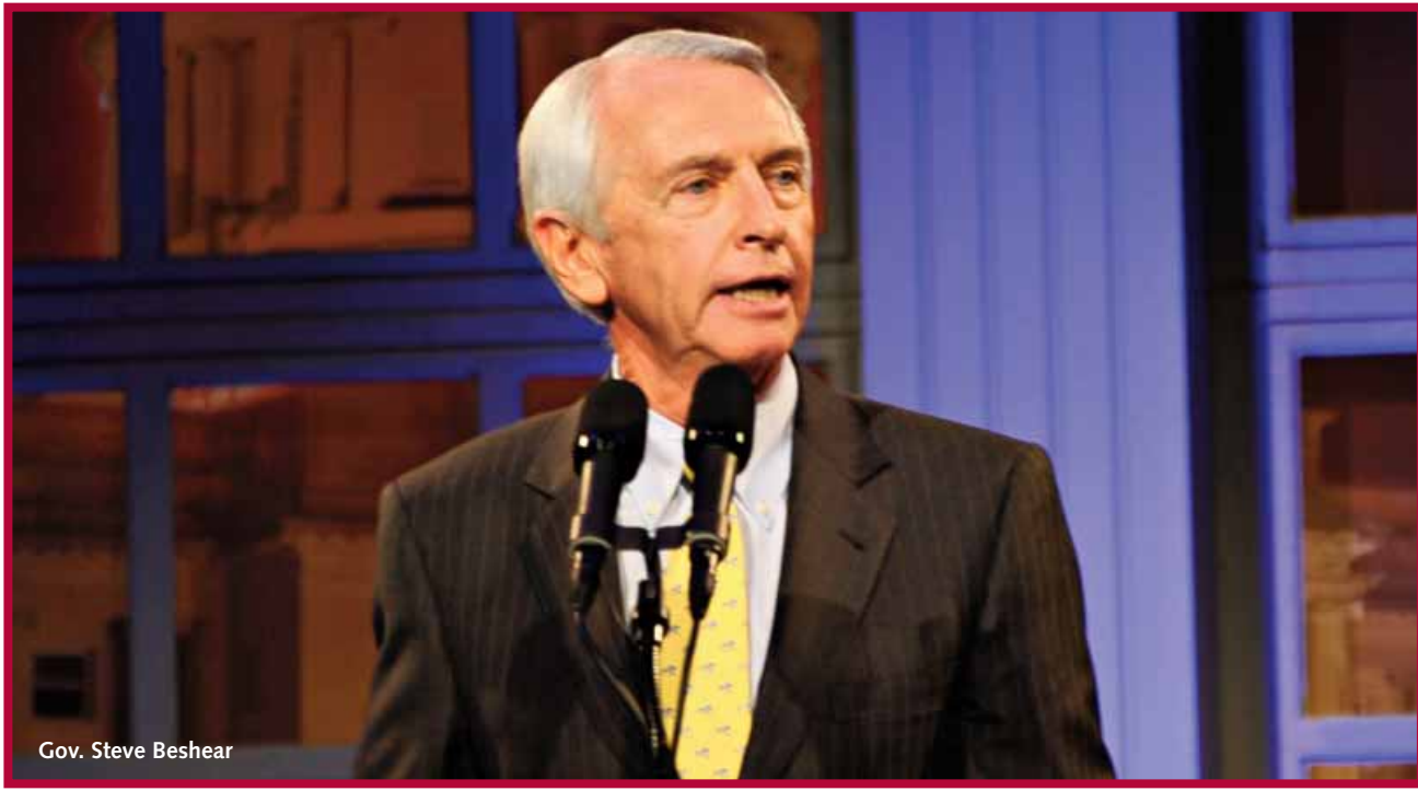
Gov. Steve Beshear