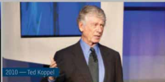
2010 — Ted Koppel