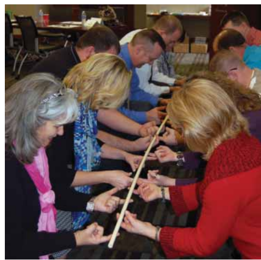
Principals from the Leadership Institute participated in a team building activity during their last session at the Kentucky Chamber office in Frankfort. Principals were instructed to lower the pole to the ground as a team using only their index fingers. Faculty from the Center for Creative Leadership challenged the principals to compare the difficulty of the activity to their daily responsibilities.

"I think in today's climate we need very innovative,