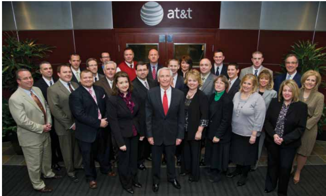
The first cohort of participants in the Leadership Institute for School Principals program (pictured above) completed their training on Jan. 19 at the Kentucky Chamber's office in Frankfort. Gov. Steve Beshear, center, visited the group to congratulate them. Cohort 2 (pictured on the cover) completed its training on Feb. 2.