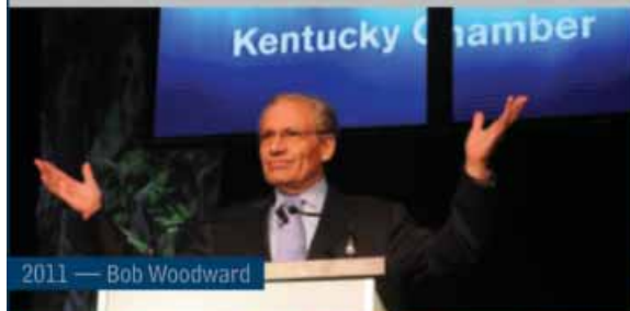
2011 — Bob Woodward