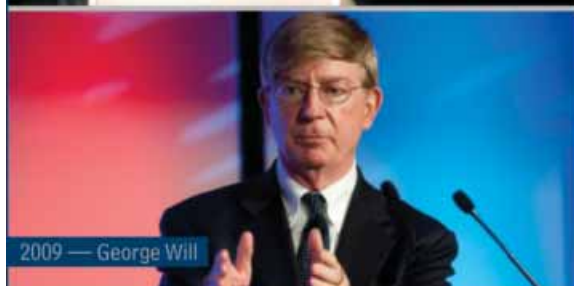
2009 — George Will