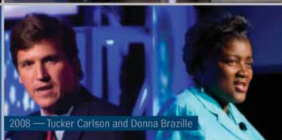
2008 — Tucker Carlson and Donna Brazille