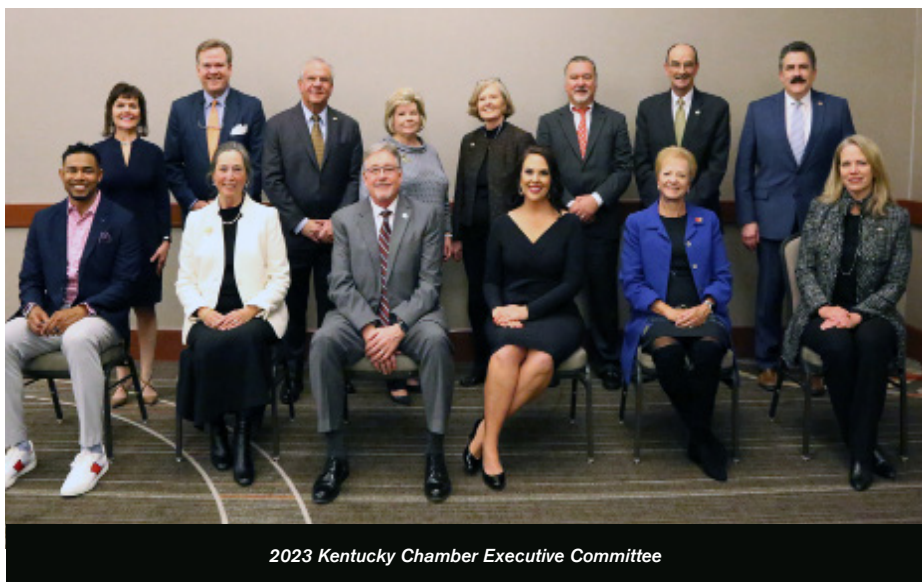
2023 Kentucky Chamber Executive Committee