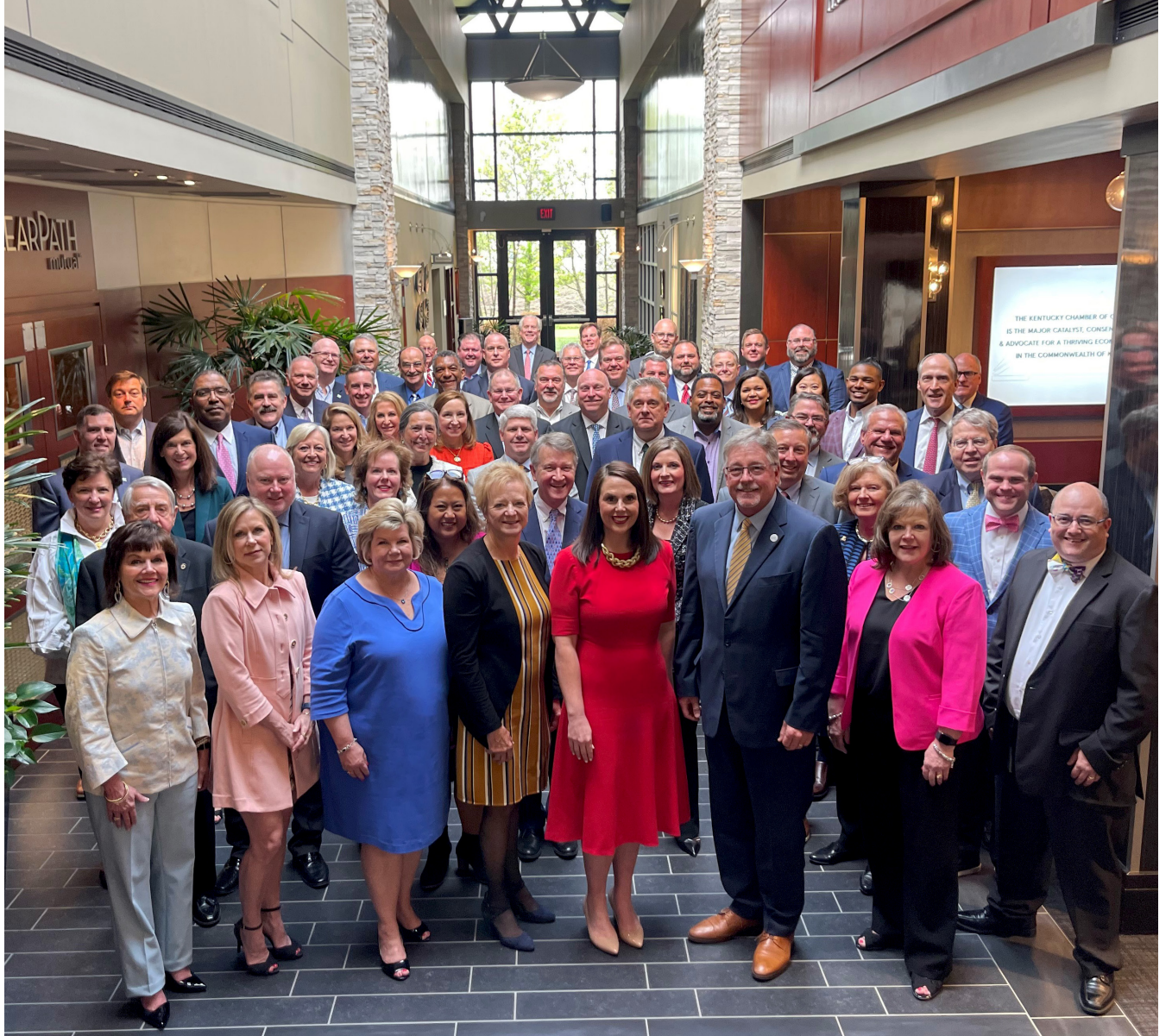
Pictured above: Kentucky Chamber's 2023 Board of Directors.

For address changes and subscription information, call 502-848-8723 .