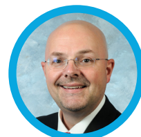
Brandon Storm Senator