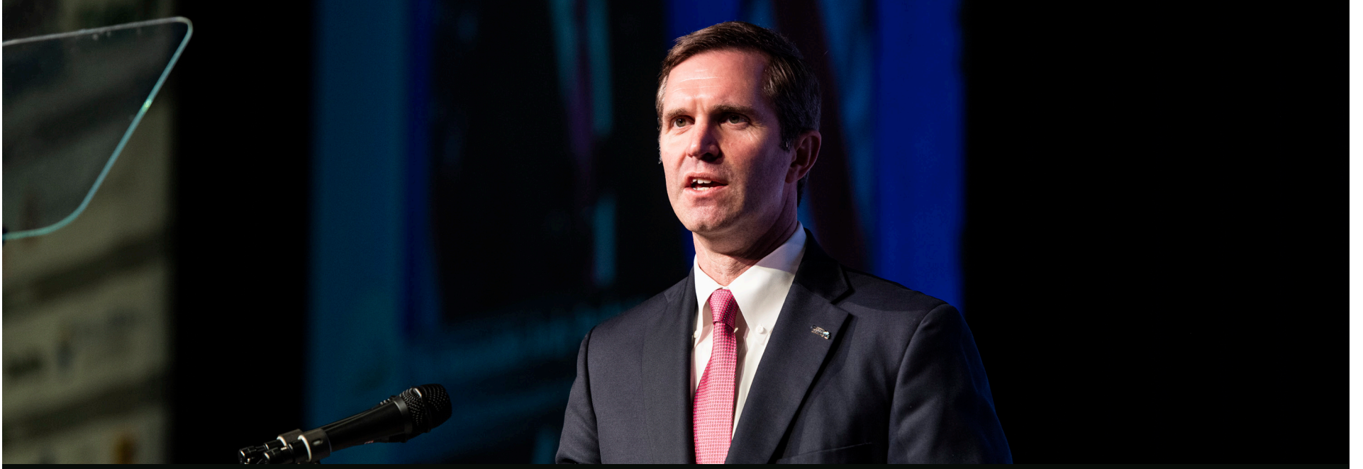
Governor Andy Beshear addresses attendees of the 2023 Kentucky Chamber Day Dinner