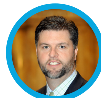
Jared Carpenter Senator