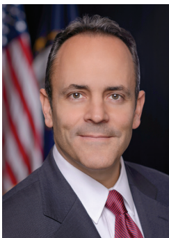
MATT BEVIN GOVERNOR

In an exclusive interview with The Bottom Line , Kentucky Gov. Matt Bevin laid out what he expects his re-election campaign to look like with the possibility of a new running mate, discussed the Democrats running for governor in 2019, and detailed what comes next on the big issues of pension reforms and taxes.