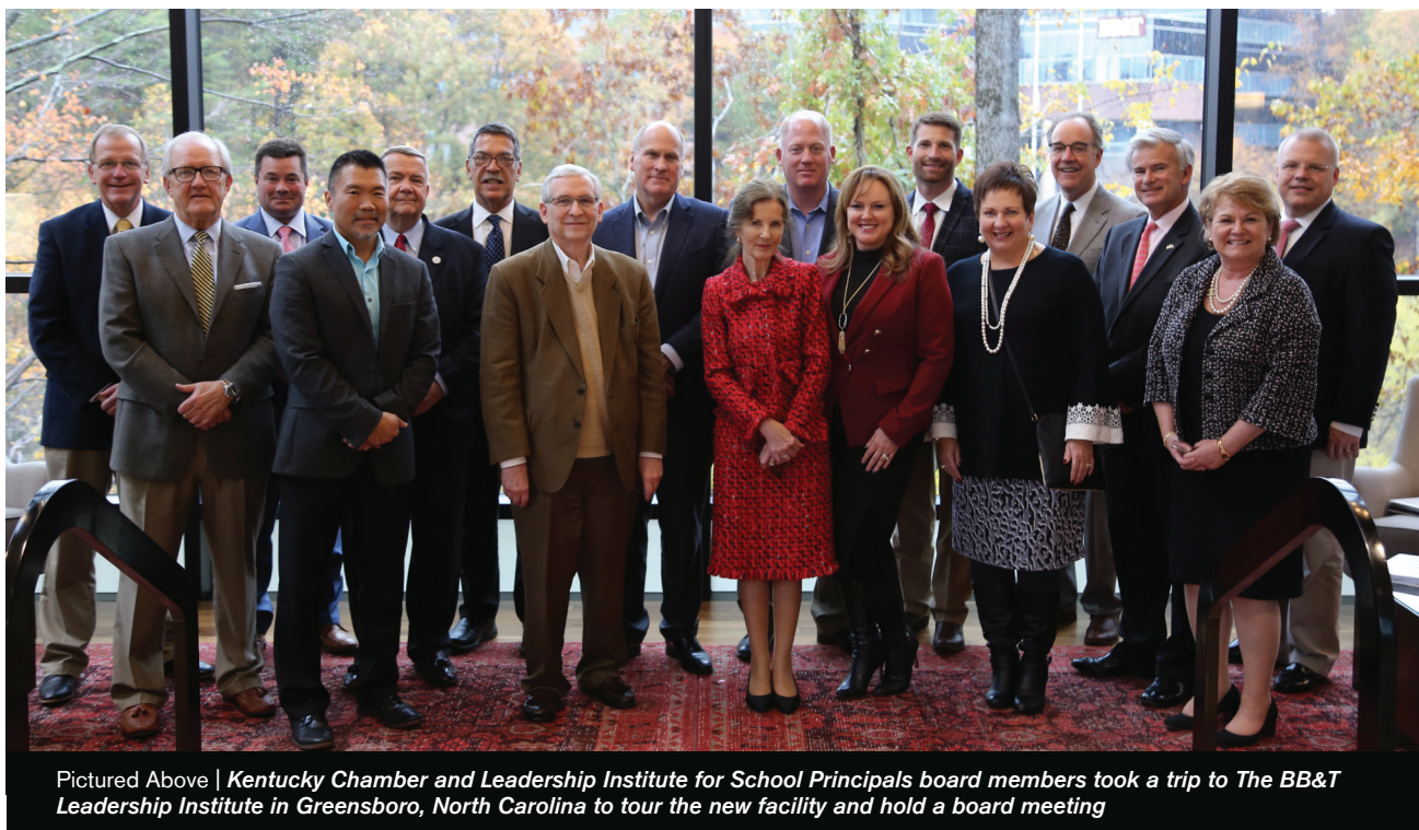
Pictured Above | Kentucky Chamber and Leadership Institute for School Principals board members took a trip to The BB&T Leadership Institute in Greensboro, North Carolina to tour the new facility and hold a board meeting