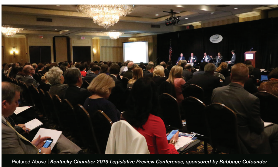
Pictured Above | Kentucky Chamber 2019 Legislative Preview Conference, sponsored by Babbage Cofounder