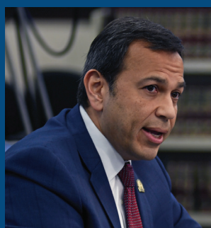
SENATOR RALPH ALVARADO