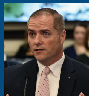
SENATOR WHITNEY WESTERFIELD