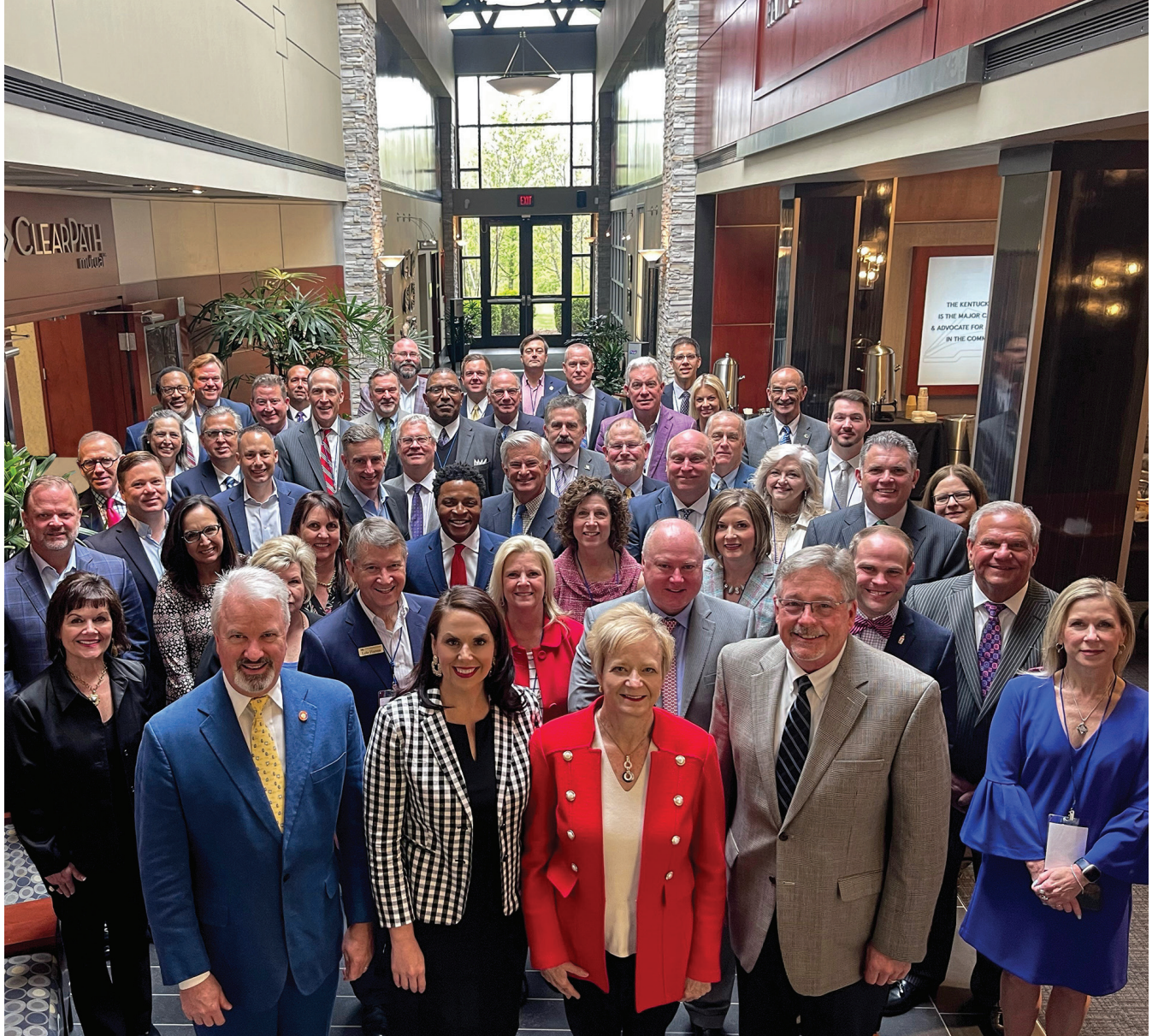
Pictured above: Kentucky Chamber's 2022 Board of Directors.

For address changes and subscription information, call 502-848-8723 .