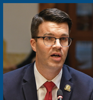
SENATOR WIL SCHRODER