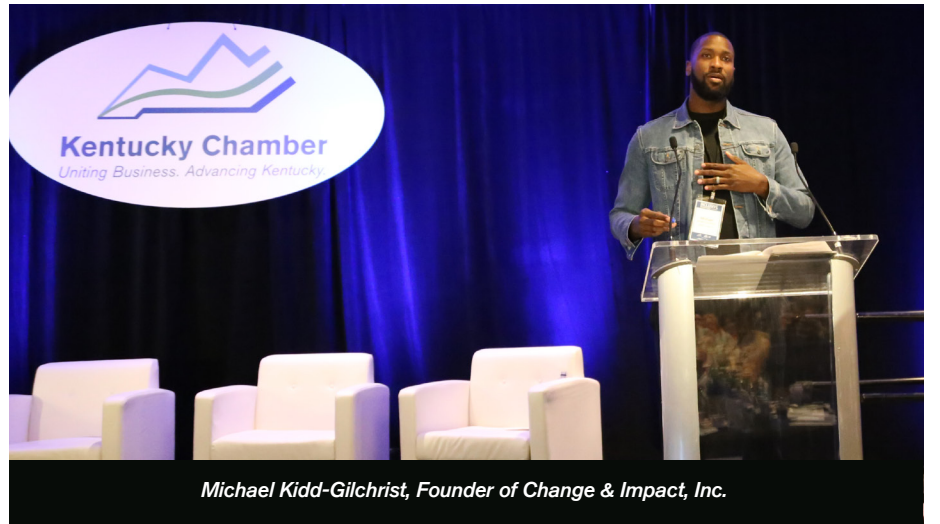
Michael Kidd-Gilchrist, Founder of Change & Impact, Inc.